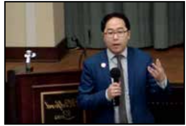
Congressman Andy Kim town hall at Medford Leas

As such we try to educate people, get them registered to vote and introduce them to candidates and their positions so that all can make informed decisions.